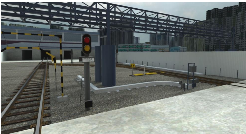
Digital twin from the VR-TSST training scenario