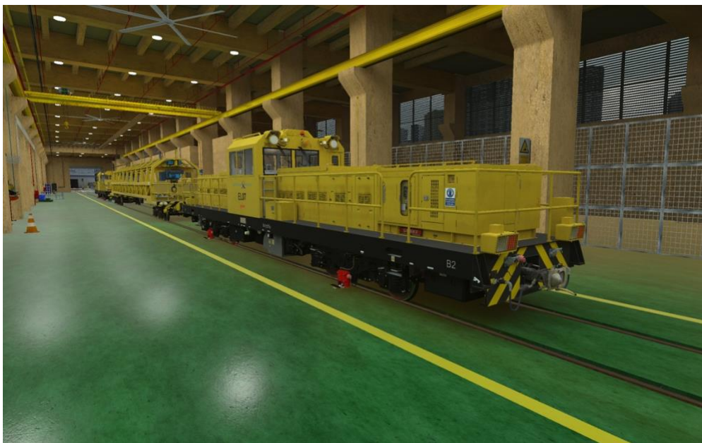
Digital twin of the locomotive at the SMRT train depot

the lever". Simulation of inspection and shunting operations allows for training of inspectors and operators. Trainees will interact in the same virtual space but need not be in the same physical location.