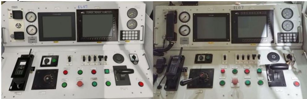
Digital twin of the cockpit

Are you able to distinguish between the virtual and real?